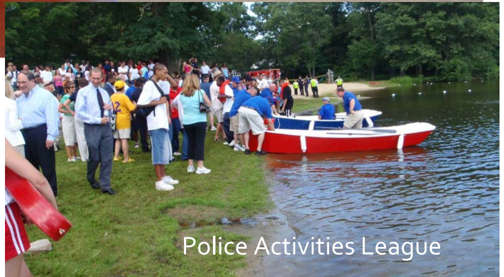
Police Activities League